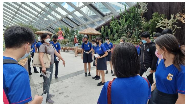
Learning Journey to Green Industry – Gardens by the Bay