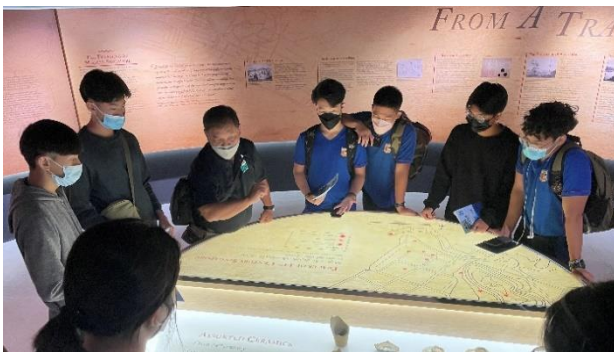
Learning Journey to Maritime Industry – Singapore Maritime Gallery

2. Sec 4 & 5 StaRs Programme. Our graduating students have successfully completed the school's iconic cohort-level student development experience from 1 to 4 March. From Elective Modules and classroom-based workshops to archery and physical learning journeys, the four-day programme has honed our students' awareness of the post-secondary options and enabled them to build skill sets to manage stress, studies, and national examinations.