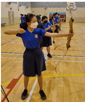
Archery as a Metaphor for Target Setting