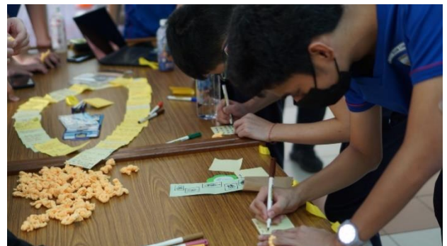
Values in Action (VIA) Empathy Walk