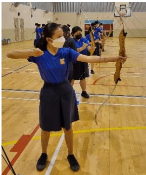
Archery as a Metaphor for Target Setting