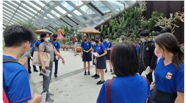
Learning Journey to Green Industry – Gardens by the Bay