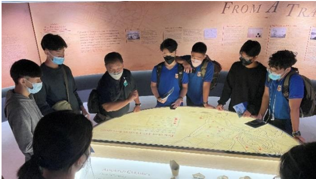
Learning Journey to Maritime Industry – Singapore Maritime Gallery

2. Sec 4 & 5 StaRs Programme. Our graduating students have successfully completed the school's iconic cohort-level student development experience from 1 to 4 March. From Elective Modules and classroom-based workshops to archery and physical learning journeys, the four-day programme has honed our students' awareness of the post-secondary options and enabled them to build skill sets to manage stress, studies, and national examinations.