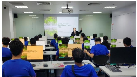
Sec 4 & 5 StaRs visiting Institutions of Higher Learning (IHLs)