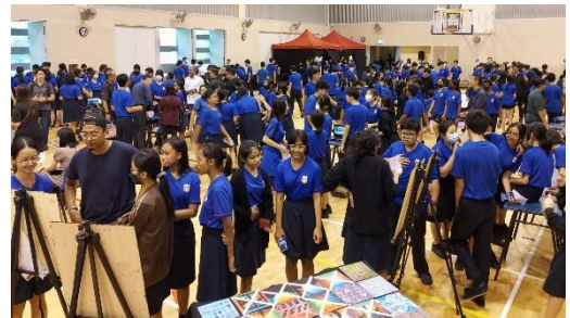
Sec 2 StaRs showcasing their learning from various ApLM @ Schools Modules