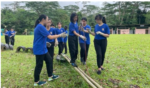
Sec 1 StaRs undergoing Low Elements

2. StaRs Programme. Our students have successfully completed the school's iconic cohort-level student development experience from 28 Feb to 3 Mar. Ranging from outdoor activities, Applied Learning Modules @ Schools, interview skills and learning journeys, the four-day programme has honed our students' social and emotional competencies and enabled them to grow holistically.