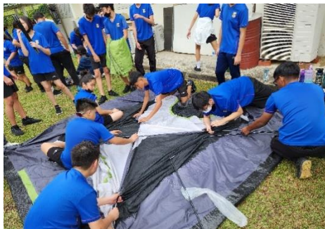
Sec 3 StaRs learning how to pitch a tent